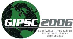
EXHIBIT SPACE APPLICATION 1st Annual Geospatial Integration for Public Safety Conference (GIPSC) Renaissance Nashville Hotel, Nashville, Tennessee April 10-12, 2006

Reserve your booth by February 28, 2006 to receive $50 off your space fee!